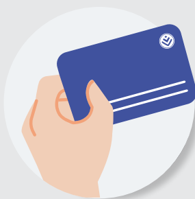
Medical scheme membership details, where applicable