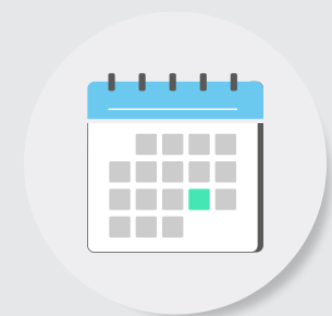
Select a convenient date and time for your vaccination at a Discovery-managed site near you